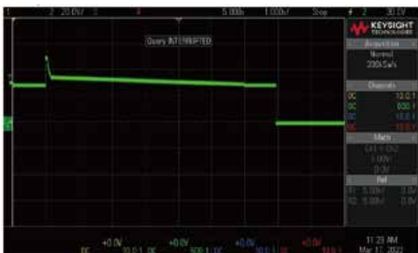
LDC302 28V abnormal voltage transients (overvoltage)