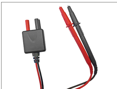
SA163: photovoltaic adapter