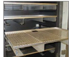
Telescopic rails for easier loading of the chamber