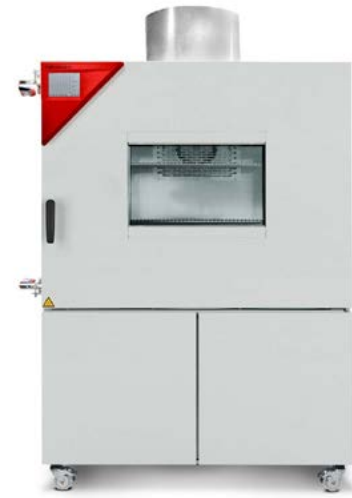
Model MK 240 with package P