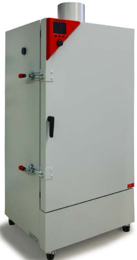
Model KB 400 with package P