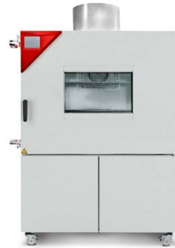
Model MK 240 with package P