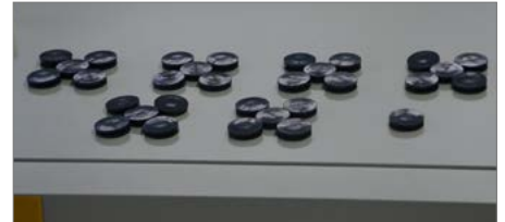
Access ports for cables and power cables.

Precise positioning in almost all sizes and locations is possible in consultation with our BINDER INDIVIDUAL department. Access ports available in silicone or stainless steel.