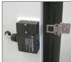
Electromechanical door lock mechanism controlled in a program and/or manually