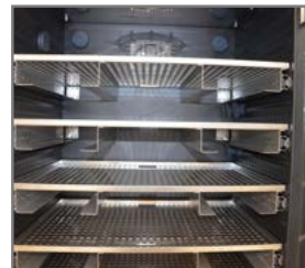
Additional access ports available in almost all sizes and locations