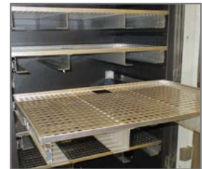
Telescopic rails for easier loading of the chamber