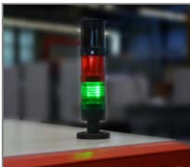
Program sequence display using indicator lamps