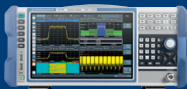
R&S®FPL1007 7.5 GHz spectrum analyzer 15 % discount