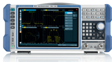
R&S®ZNL6 6 GHz 3-in-1 vector network analyzer 15 % discount