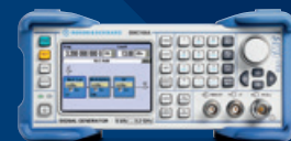
R&S®SMC100A 3.2 GHz signal generator 10 % discount