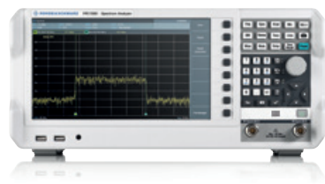
R&S®FPC1500 3 GHz spectrum analyzer 36 % discount