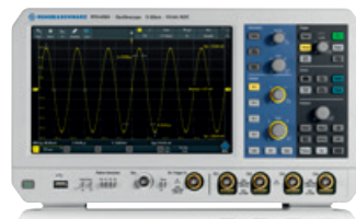
R&S®RTA4004 1 GHz oscilloscope 55 % discount