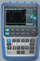
R&S®RTH Scope Rider 500 MHz Handheld Oscilloscope Savings up to € 4.390