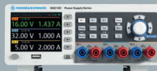
R&S®NGE100B 100 W power supply Savings up to € 305