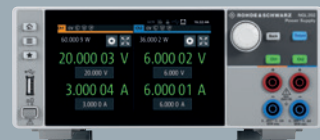
R&S®NGL200 100 W high precision power supply and sink Savings up to € 380