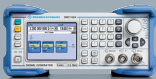
R&S®SMC100AP31 Signal generator Savings up to € 800