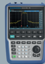
R&S®Spectrum Rider FPH 4 GHz handheld spectrum analyzer Savings up to € 5.539