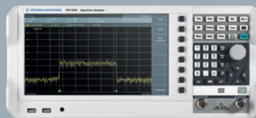
R&S®FPC1500 3 GHz Spectrum analyzer Savings up to € 2.480