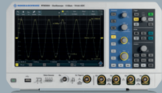
R&S®RTM3000 1 GHz Oscilloscope Savings up to € 8.205