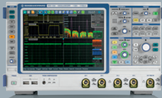
R&S®RTE1000 1 GHz Oscilloscope Savings up to € 17.060