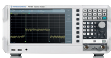
R&S®FPC1500 3 GHz spectrum analyzer 36 % discount