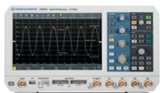
R&S®RTB2000 300 MHz oscilloscope 43 % discount