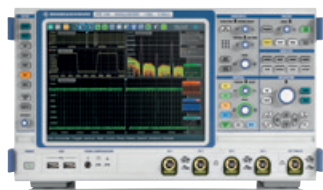
R&S®RTE1000 2 GHz oscilloscope 50 % discount