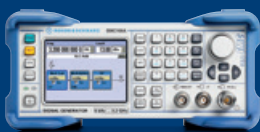
R&S®SMC100A 3.2 GHz signal generator 10 % discount