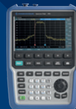
R&S®Spectrum Rider FPH 4 GHz handheld spectrum analyzer 48 % discount