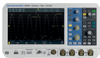
R&S®RTM3000 500 MHz oscilloscope 51 % discount