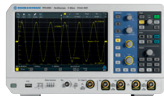
R&S®RTA4004 1 GHz oscilloscope 55 % discount