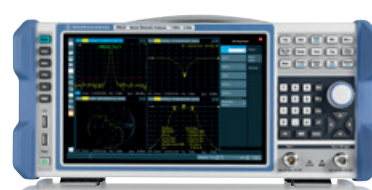
R&S®ZNL6 6 GHz 3-in-1 vector network analyzer 15 % discount