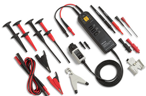
Tektronix Power Probes