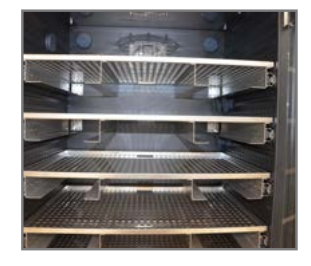
Additional access ports available in almost all sizes and locations