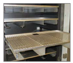
Telescopic rails for easier loading of the chamber