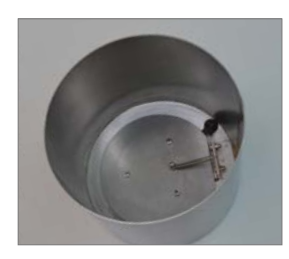
Pressure relief flap with an additionalrelieving spring as a safety measure in the event of faults