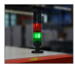
Program sequence display using indicator lamps