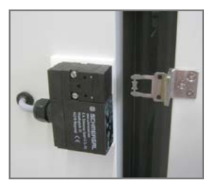
Electromechanical door lock mechanism controlled in aprogram and/or manually