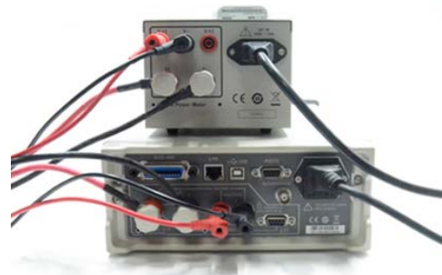
Figure2 Wiring Diagram of ITECH Evaluation

Put the smart socket into the test fixture, simply open the power switch of the smart socket (power indicator is red). As the main purpose of this test is to test the standby power consumption, no need to connect with any external electrical devices.