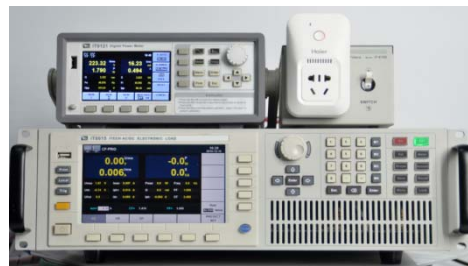
Pic.1 IT8615 AC/DC load+IT9121power meter Pic.2 IT7326AC power supply