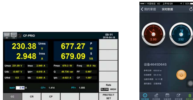
Picture 3 Load test parameters & user terminal parameters

Through the comparison, we can find there's 0.002A difference. As a household item, it can meet the basic requirements.