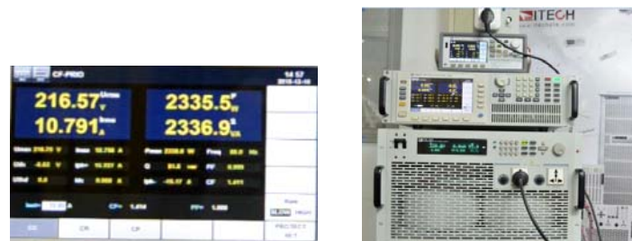
Picture 6 Screenshot of over current protection point

With more appliances to be used in each house, especially the high-power ones, when they make our life convenient, they will also bring more risks of electricity safety. At present, when current is over high or there's short circuit, the protection can be done via the air switches. As a control device, when there's over current, the smart socket should also have short-circuited protection. By combining IT7326 AC power supply, IT8615 AC/DC load, and IT9121 power meter (including IT185 fixture), a test platform for smart socket over-current point has been set up, so that we can do test of over-current protection of the smart socket. Please check Picture 6